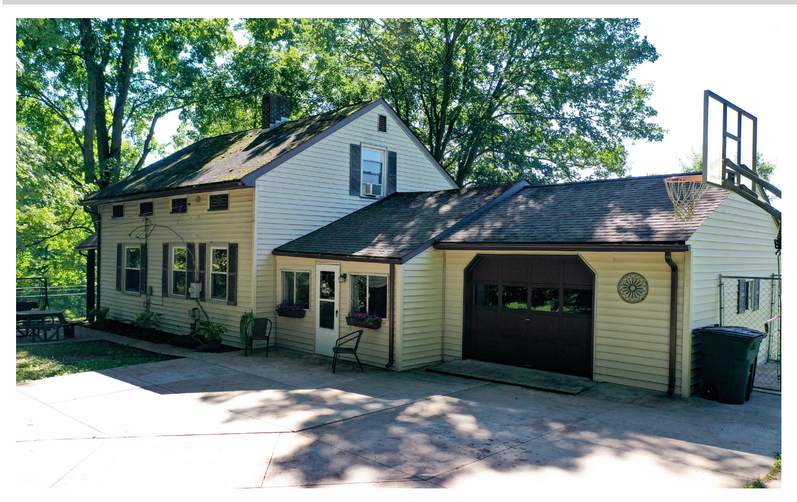
Information is believed to be accurate but not guaranteed. KIKO Auctioneers